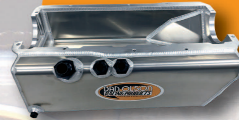
Ford 351 Dry Sump #DS351AK