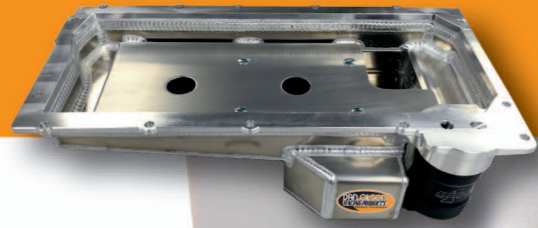
LS Camaro with OEM Filter #WSLS1CA