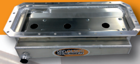
Chrysler 426 Kickout #WS426K