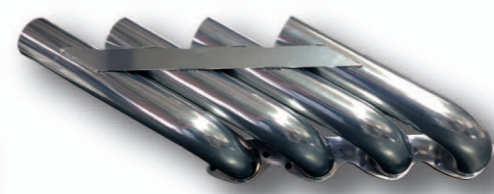
Hydro Header #SST45