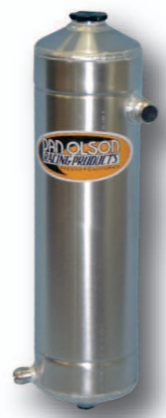
Dry Sump Oil Tank #DT100