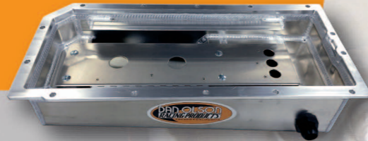
Noonan Funny Car #NONFC103