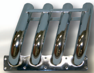
Tractor Header #TPZ15