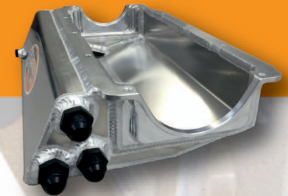
Small Block Pavement Sprint Car #DS350LPK