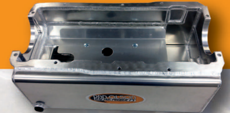
Ford 351 Wet Sump #WS351AK