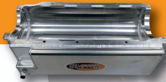
Big Block Dry Sump #DS427AKR