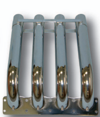
Truck Header #TPZ24