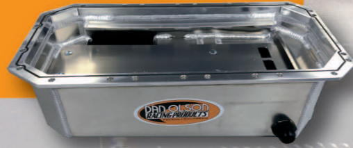
TFX Dragster #WSTFXD