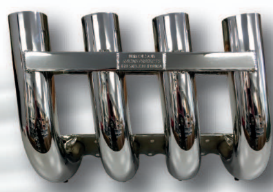
Minirod Tractor Header #TPZ12