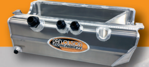
Rocket Dry Sump #DS400K