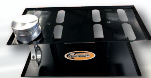
Piston Tray #PT100