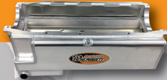
Big Block Step Sump #WS427ASK