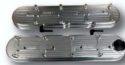
Billet LS Cover #VCLS100