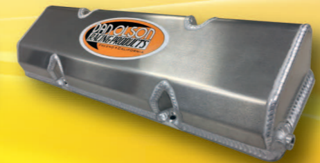
Small Block Sprint Car Valve Cover #VC100CO

2744 North Argyle Fresno, California 93727