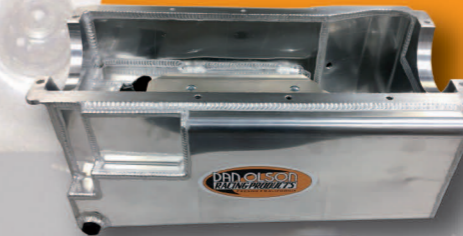
Ford 460 Wet Sump #WS460AK