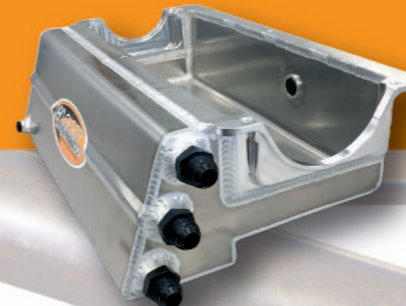
Small Block Sprint Car #DS350LDK