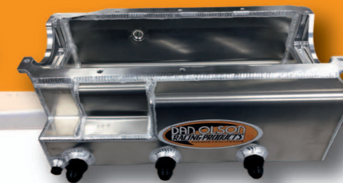
Small Block Drag Race #DS350ADR