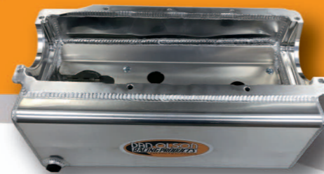
Small Block Wet Sump #WS350KA