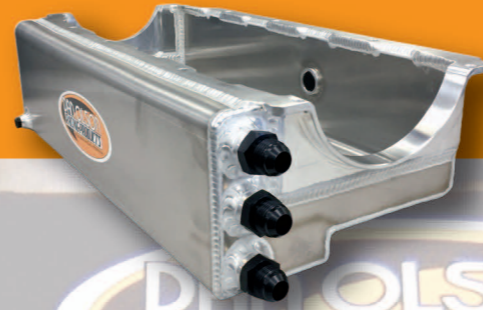
Big Block Modified #DS427AK